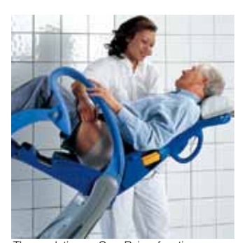
The revolutionary Care Raiser function gently lifts the resident's posterior clear off the Carendo seat, making basic routines in elderly care far easier

Our extensive experience and focused product development give the Carendo a unique feature - the Care Raiser function. It enables the lower part of the resident's body to lift, which gives easy and discreet access for sensitive tasks, allowing care with dignity. The resident can be moved fully dressed to and from the showering area. With the Care Raiser function a single caregiver can easily manage the whole procedure alone from undressing, showering to dressing. Changing of incontinence pads is also carried out in the best possible way. This eliminates awkward handling of hygiene routines on the resident's bed.