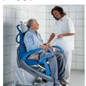
The unique chassis and chair seat design allows the Carendo to integrate with floor or wall mounted toilets. After toileting, the open seat area allows easy access to clean the resident. The Carendo can also be equipped with a bedpan