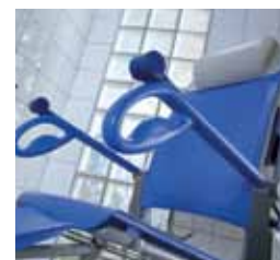
Multiple handles for safety and comfort.