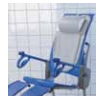
Back pillow NEA0001-031