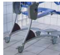
Light framework with open design for easy transport.