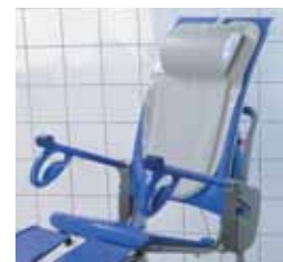
Backrest designed to accommodate residents of different shapes and sizes.