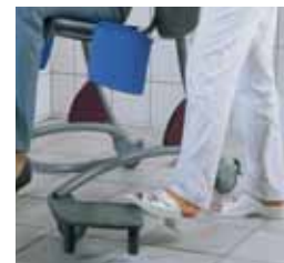
Foot operated, swivelling footrests.