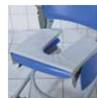
Seat cushion NEA0003-031