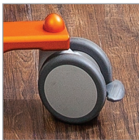
Four high-quality double castors, two of them with brakes, provide easy movement.