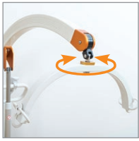
Carrybar with anti-rotation mechanism (ARM) and a free rotation area of 360°.