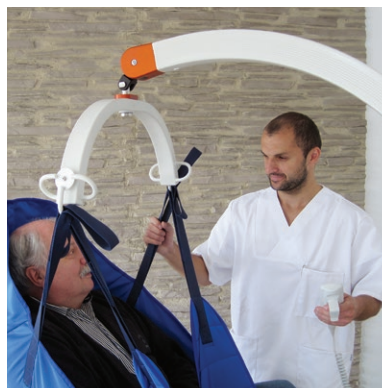
Electrical height adjustment with lowering of the carrybar to the floor. Also includes manual emergency lowering system.