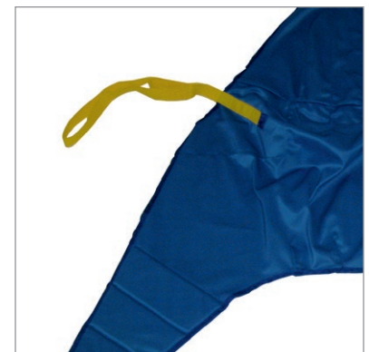
Wide choice of loop slings.