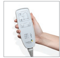
Cable remote control with display of the charging condition of the battery, failure diagnostics, service.