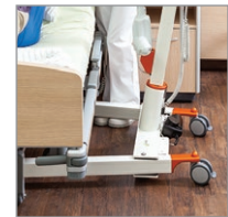
Electrically spreadable legs with low height to pass underneath baths and beds.