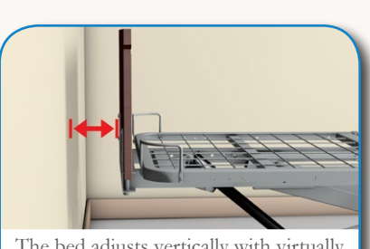
The bed adjusts vertically with virtually no horizontal motion, saving space and protecting the bed environment.