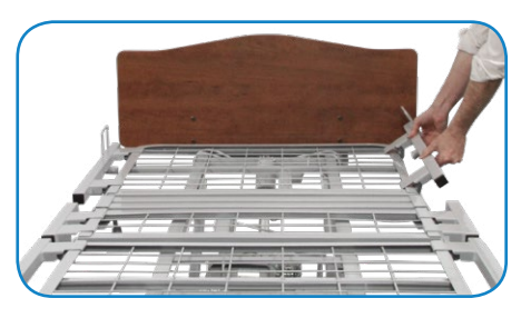
Attach easy-on expanders tool-lessly to both sides of the head, seat and foot decks after corner mattress retainers have been removed.