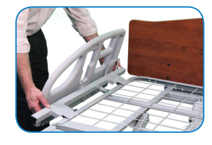
Our molded plastic and metal half-head assist rails are both compatible with the expanders, mounting securely to the expanders before installation.