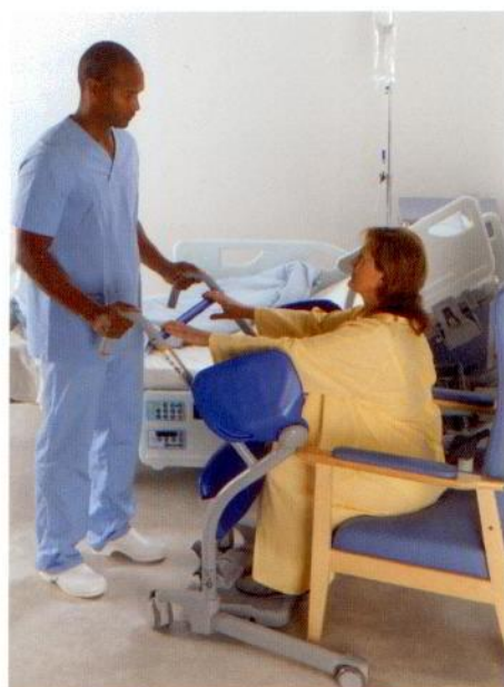
Approach the resident/patient, open seat flaps, open chassis legs and place the resident's/patient's feet on the footboard